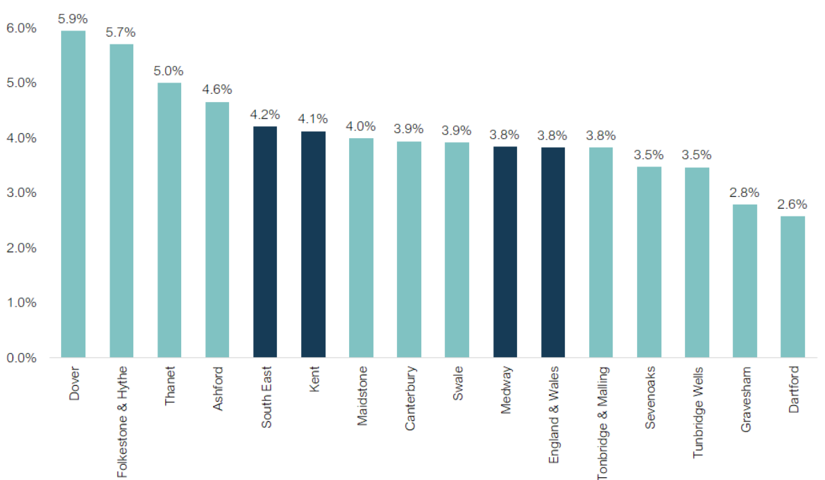
Proportion of the 16+ population who are armed forces veterans

2021 Census: The Office for National Statistics (ONS), Chart presented by Kent Analytics, Kent County Council